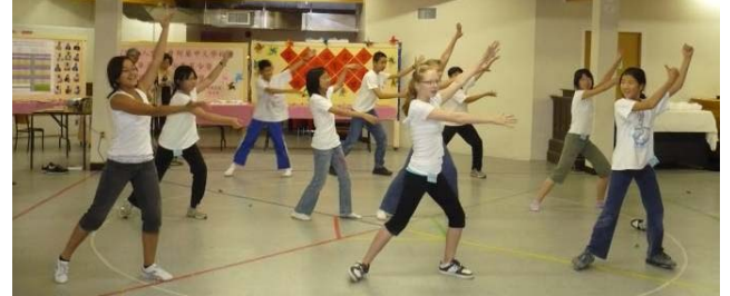
Tribal Dance - Modern Dance – Kung Fu Dance

The Regina School of Chinese Studies will host a 5-day Community-wide Chinese Summer Culture Camp sponsored by the Overseas Chinese Affairs Commission, to promote Chinese culture. The camp will be held from July 12 to 16, 2010, 9:00 a.m. to 3:30 p.m. daily, at the Regina School of Chinese Studies, 3010E Arens Road. Programs will include Chinese folk dances, handicrafts, Chinese Yoyo and Physical Education including Kung-fu.