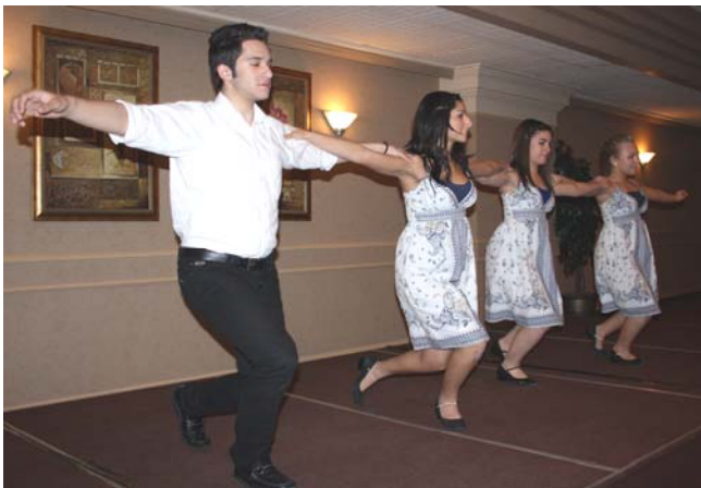
Dances by Mythos Group–Greek Language School