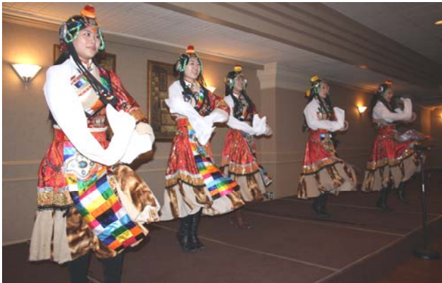
Dances by Regina School of Chinese Studies