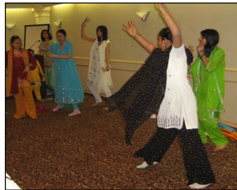
Dance by students of the ICA-Hindi Language School

Entertainment was provided by the following groups as part of the Workshop on the Friday evening program: