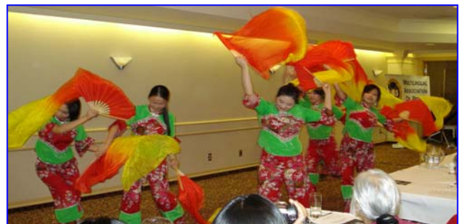
Above, a colorful "KaiMenHong" dance by Regina School of Chinese Studies, this time by a group of 6 dancers.