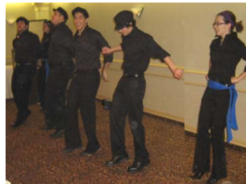
Dance by the Mythos Group on behalf of the Greek Language School