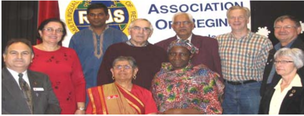
MLAR Board Members and Special Guests