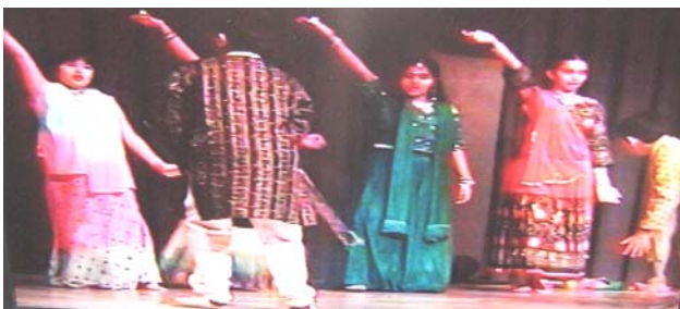
ICA-Hindi School Flag, Song and Dances