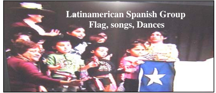
Latinamerican Spanish Group Flag, songs, Dances