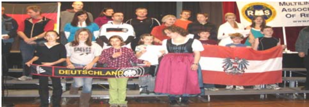
German Language School and German National Anthem