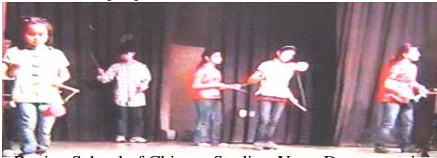
Regina School of Chinese Studies Yoyo Demonstration