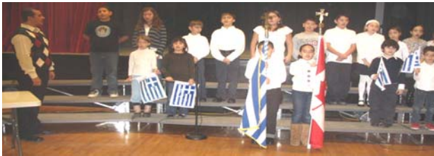
Greek Language School and Greek National Anthem