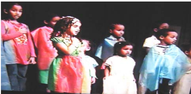
Eritrian School: Flag, Songs and Dances