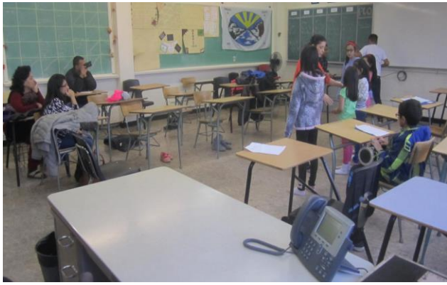
Above, photo of Chinese School at Balfour Collegiate, photo taken just prior to the end of the 2015-2016 school year.

For school year 2016-2017, there are 16 different language schools using Balfour classrooms. This includes two new schools that have joined MLAR this summer: the MCNA Arabic School, and the Kirundi (Burundian) School. Because of the heavy demand for classrooms especially on Saturdays, MLAR a few years ago had to establish fixed classroom schedules which are (1) from 10:00 AM to 12:00 PM; (2) from 1:00 PM to 3:00 PM, and (3) from 3:15 PM to 5:15 PM at Balfour Collegiate.